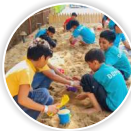
SAND PLAY AREA