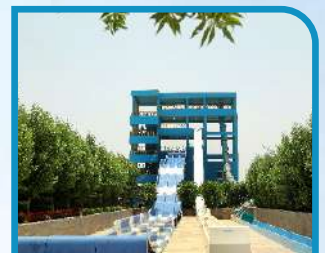
MULTI RACER SLIDE