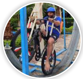
360 DEGREE CYCLE