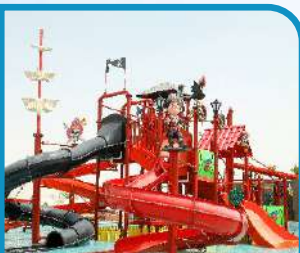
PIRATES KIDS POOL